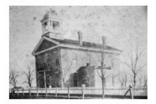
Historic Tours to include the Old Rolla Courthouse built in 1860 and the Old Stagecoach Stop in Waynesville

*2025 Reunion Medal included for first 100 Member's Registration